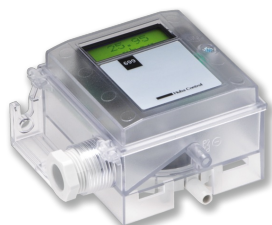
DIFFERENTIAL PRESSURE TRANSDUCER 699